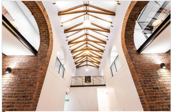
Figure 3: The timelessness elegance of face brick provides a fusion of old and new in the construction of the new boarding house at St David's Marist Inanda..

Although some alternative systems may perform as well as masonry for frequencies in the speech range, these lower mass systems have difficulty insulating against low-frequency noise.