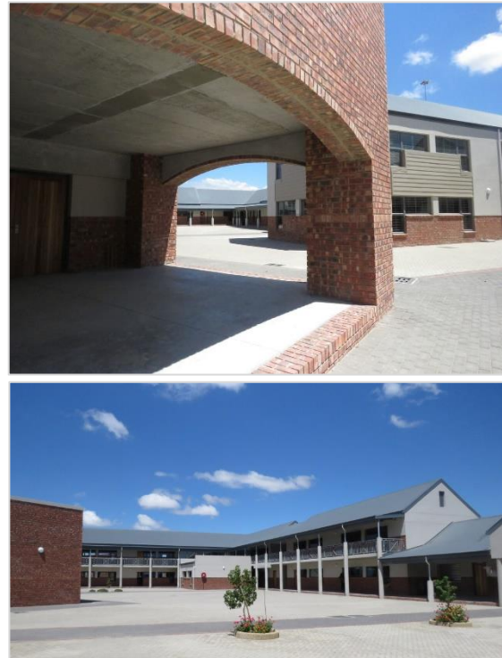
Figure 5: Zweletemba High School in the Western Cape makes extensive use of face brick. This provides an aesthetic, low maintenance finish as well as built in noise and heat insulation.

Many older buildings are having to be retrofitted with sound insulation and acoustic panels at a huge cost. By applying the walling materials during construction, effective acoustics are “built-in to living, working and learning spaces.