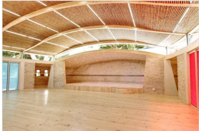
Figure 4: The dynamic double-curved clay brick walls, arching timber beams and slatted bamboo ceiling work together to provide a sustainable building with enhanced acoustics at the Constantia Waldorf School.

The longer the reverberation time, the lower the comprehension ability. This means that speaking louder will not make a difference to clarity, and it will make the environment more confusing.