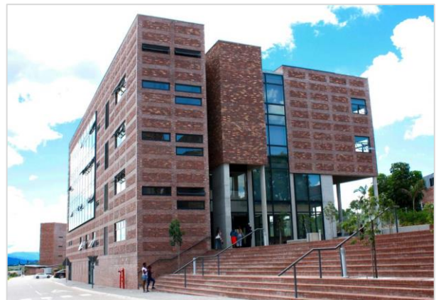
Figure 1: The University of Mpumalanga. Dense clay brick masonry resists the transmission of airborne sound waves. Due to these natural acoustic properties, pupils and teachers are not subjected to excessive noise transmitted from adjoining buildings or classrooms.

According to the World Health Organization, the safe level of noise in a classroom cannot exceed 35 decibels. From there, the ability to learn is impaired. In France, a study found that with every 10-decibel increase in classroom noise, students' language and math scores decreased by 5.5 points.